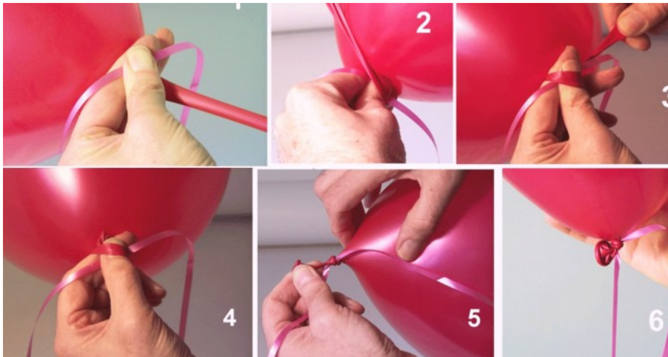
Tying a latex balloon

This does work! Try the technique a few times on an un-inflated balloon and then fill one with air and try again. Do this a few days before your event and you will save lots of time on the day.